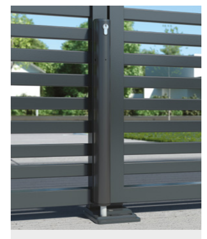
ELECTRADROP-R Motorized electrical drop bolt

VALENTINO Surface mounted battery powered code lock