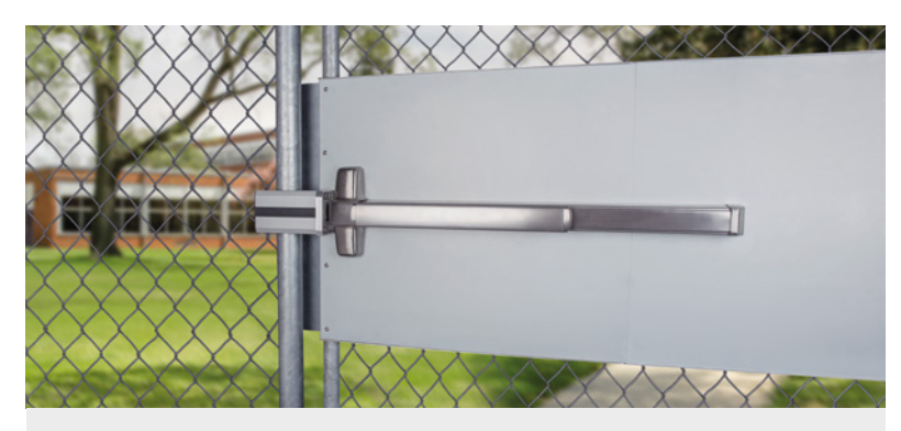
PANICBAR Complete set to add a rim style emergency exit device to any gate