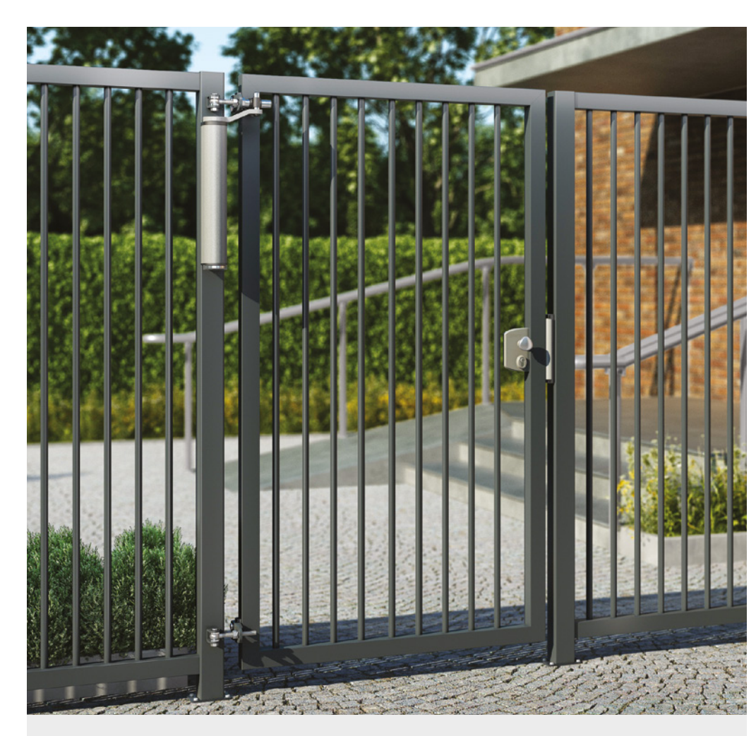
VENUS Motorized gate closer for pedestrian swing gates